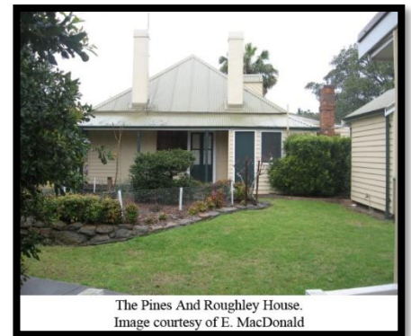
The Pines And Roughley House.

There is a café next door (more expensive than usual) or take your own lunch to have at nearby lookout.